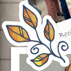
Books and snacks with everyone!

Chinese calligraphy, beekeeping, coffee and chocolate tasting, magic shows, puppet shows, book banning programs, an evening with an FBI profiler, artist presentations, The Graveyard Girls, and so much more!